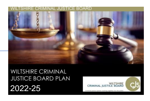
Wiltshire Criminal Justice Board